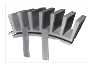
Severe wear caused by abrasive paper products is eliminated on fingers of a packaging machine separator.

FDA compliance. MAGNAPLATE HCR-FDA is compliant for use in "foodcontact involving repeated use, such as food processing equipment."<sup>2</sup> No other surface enhancement coating can give aluminum parts 10,000 hours of salt spray corrosion resistance in food contact applications.